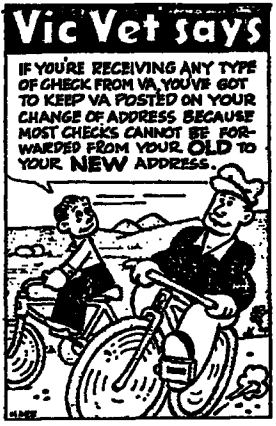
For full information contact your near VETERANS ADMINISTRATION offer ..........

VA said the big increase in appraisal requests, which was general throughout the country, reflects an easing of the supply of GI loan mortgage money in many sections. as the supply of GI money eases, so do the terms on which lenders will grant loans to veterans. A survey completed in February shows that 15 percent of all GI home loans were made without down payments; and that lenders are writing more loans with longer repayment periods.