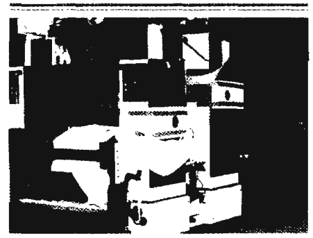
Does this help? See page 12 for the full story.

March 30–Baltimore Federal Executive Board's Federal Women's Program Conference, 8:00 a.m.-4:00 p.m., Martins West, subscription $45