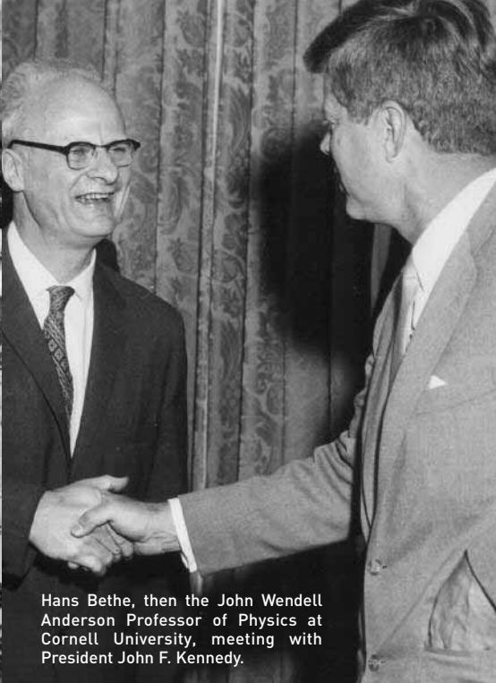
Hans Bethe, then the John Wendell Anderson Professor of Physics at Cornell University, meeting with President John F. Kennedy.