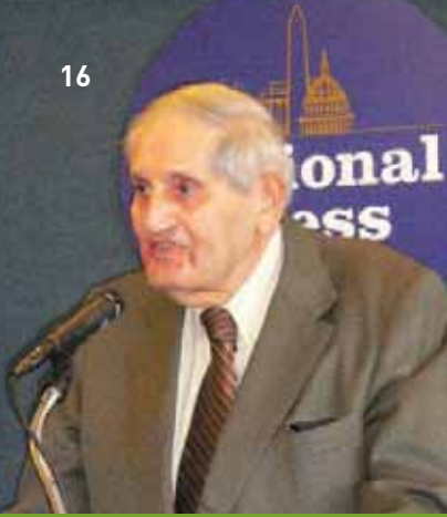
By Carl Kaysen, the Deputy Special Assistant for National Security Affairs under President John F. Kennedy.