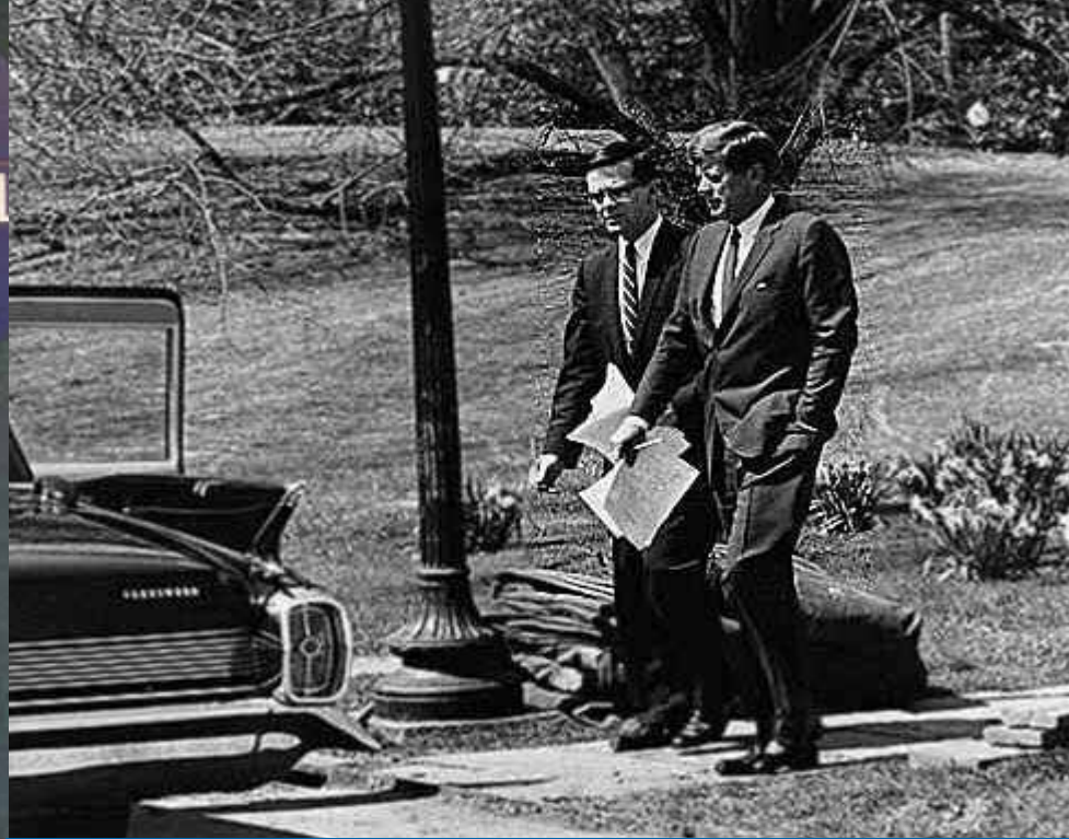
Ted Sorensen with President John F. Kennedy

Remarks by Theodore Sorensen at the FAS 60th Anniversary symposium at the National Press Club in Washington, DC on Wednesday November 30, 2005.