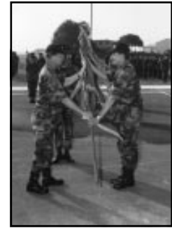
Page 18 unit news