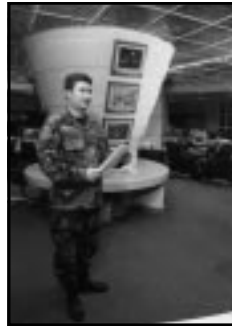
Page 4 in focus: IO