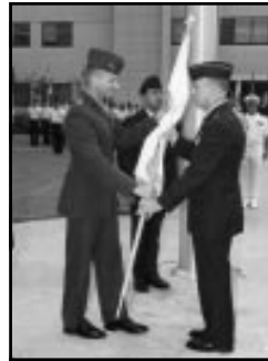
Page 11 around the command