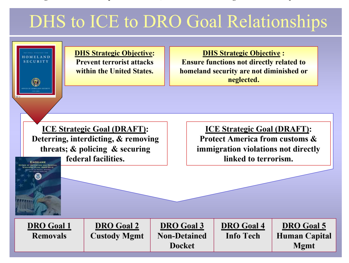
Figure 1. Relationship between DRO, ICE and DHS Strategic Goals and Objectives

When implemented to its fullest, this plan will serve as the platform from which strategies will be initiated, partnerships will be built, and innovation for continued process improvement will be fostered. This vision will be realized, and the mission will be accomplished, only through the collective and collaborative efforts of all DRO employees. DRO employees (including officers, management, and staff) must encourage growth and improvement through the sharing of ideas and the integration of DRO <u>core</u> <u>business functions</u> with key processes, all critical elements of the immigration enforcement program.