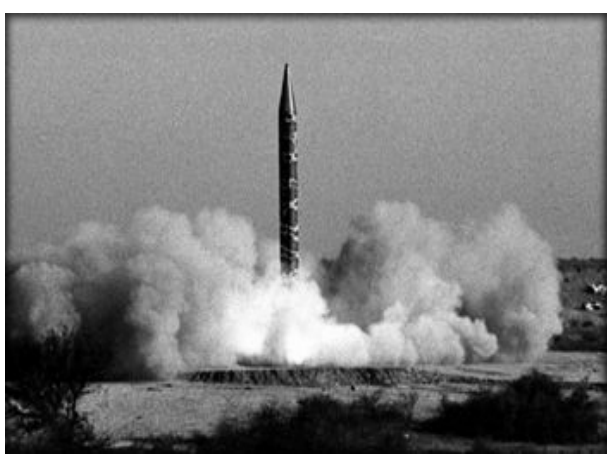
Pakistani test of the Ghauri missile in April 1999

committed itself to destroy its chemical weapons. Pakistan, too, is a member of the CWC. Neither India nor Pakistan have joined the Nuclear Non-Proliferation Treaty<sup>1</sup>, and so far both countries have refused to sign the Comprehensive Test Ban Treaty. Meanwhile they are continuing the development of their respective nuclear weapons programmes. In May 1998 both countries carried out nuclear tests; in 1999 and 2002 they both tested medium-range and long-range missiles.