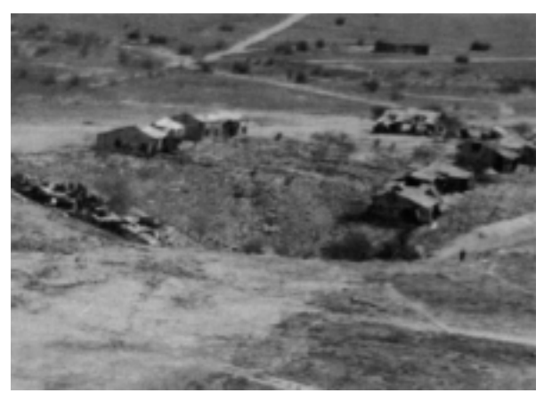
Nuclear test site at Rajasthan, India

Syria has programmes for the development of chemical weapons and ballistic missiles. The country sees these weapons as an indispensable deterrent in case of, for example, rising regional tensions. Syria is no party to the Chemical Weapons Treaty.