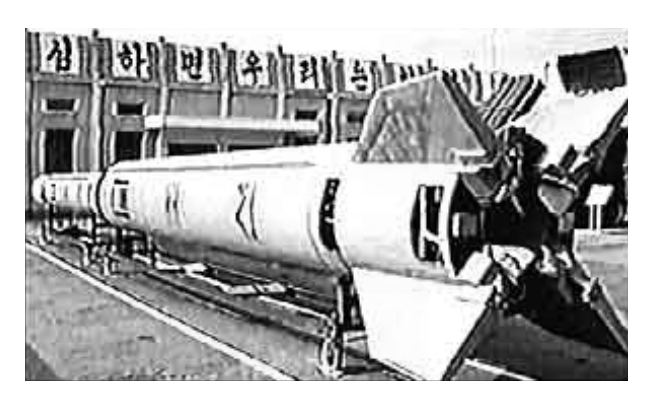
A North Korean Taepo-Dong missile

North Korea has an extensive ballistic missiles programme and sells goods and technology relating to this programme to other countries of concern. North Korea has also frequently been accused of not completely having abandoned the idea of a nuclear weapons programme, despite its agreement<sup>2</sup> with the US on that subject, signed in 1994. North Korea tested a medium-range missile in 1998. By the end of 2002, North Korea openly admitted to have pursued the possession of nuclear weapons, and early 2003 the country announced its decision to withdraw from the Nuclear Non-Proliferation Treaty. By now the country has restarted one of its nuclear reactors that were closed under the 1994 treaty.