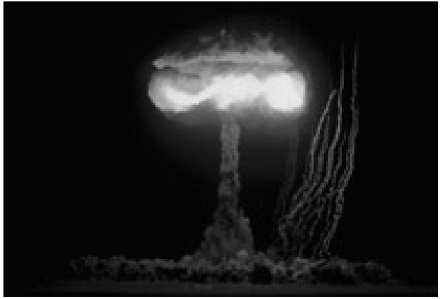
Nuclear explosion

In order to produce nuclear weapons (nuclear explosion weapons) it is necessary to have plutonium or highly enriched (weapons-grade) uranium. These fissionable materials are not freely available on the international market. They can only be produced through complicated separation processes, for example in a nuclear reactor or ultracentrifuge system. So if a country or organisation wishes to develop a nuclear weapons programme, it needs nuclear projects for the production of the required fissionable material. Civilian nuclear projects, like nuclear energy projects, usually do not require plutonium or highly enriched uranium.