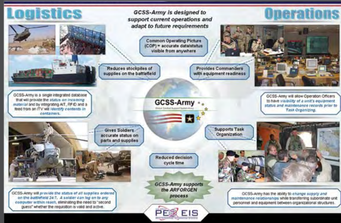
A critical component of the Single Army Logistics Enterprise (SALE)