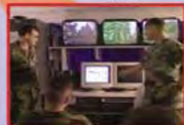
After Action Review