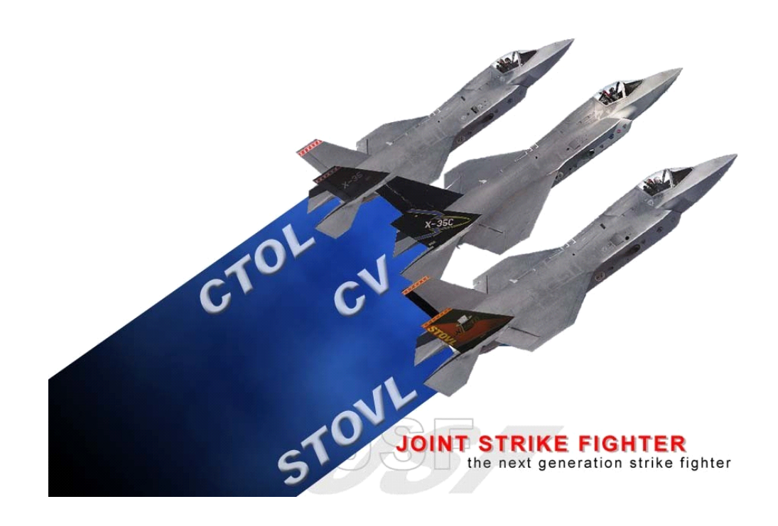
F-35 As of December 31, 2010

Defense Acquisition Management Information Retrieval (DAMIR)