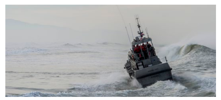
Coast Guard crews train in high surf to ensure they are prepared to respond to any maritime emergency during rough weather conditions.

Current DoD-specific resources for climate data, analysis, and assessments include, but are not limited to, the DCAT; the U.S. Army Climate Assessment Tool (ACAT); the U.S. Air Force 14th Weather Squadron within the 557th Weather Wing under Air Combat Command; and the Climatology Division at Fleet Numerical Meteorology and Oceanography Center. DoD relies on authoritative scientific data and modeling provided by USG science agencies. Improvements in predictive capacity of short- to medium-term weather anomalies are needed to have