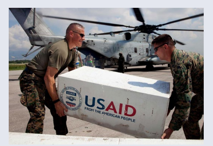
DoD supports the US Government Assistance to Haiti after Hurricane Matthew in 2016.