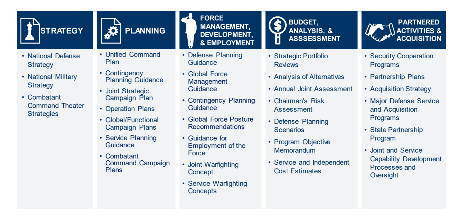
Figure 3. Examples of DoD documents in which climate will be incorporated.

Strategic documents signed by the Secretary or other senior DoD leaders guide DoD Components, formalize priorities to direct resource allocation, and drive action to accomplish desired ends. As required by EO 14008, Section 103(d), DoD will incorporate climate considerations into the National Defense Strategy (NDS); Defense Planning Guidance (DPG); the Chairman's Risk Assessment; and other relevant strategy, planning, and programming documents and processes. A report on progress of this integration is due annually to the National Security Council starting in January 2022. Climate change will be integrated into several of these documents through the office of the Assistant Secretary of Defense for Strategy, Plans, and Capabilities under the USD(P). In addition to the guidance in EO 14008, Section 103(d), DoD will also include consideration of climate across all relevant strategy, planning, force management, force employment, force development, and budget documents as discussed below and summarized in Figure 3.