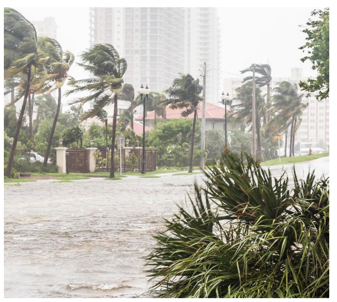
There is evidence that climate change is making hurricanes stronger and more destructive.

DoD plays an important role in the whole-ofgovernment effort to address climate change security risks, which includes working closely with allies, partners, and multilateral institutions to mitigate future climate change and adapt to those changes that