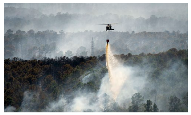
A Texas Army National Guard UH-60 Black Hawk helps fight wildfires.

The CPG addresses preparation and review of contingency and campaign plans, including homeland defense and military support to civil authorities. The 2021 CPG includes prioritization of severe weather challenges to war plan development, and future CPGs will include consideration of other aspects of climate change.