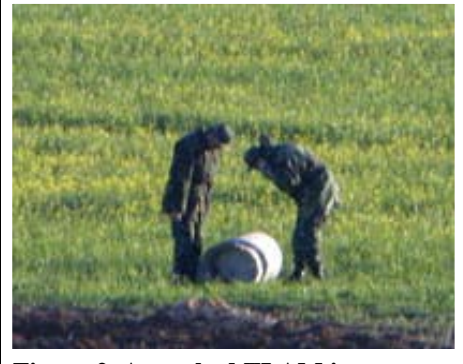
Figure 2. A crashed TLAM in a Turkish field, 29 March 2003.

In addition to these logistical and flexibility issues, reliability had become a concern with TLAM/N based on the experience with conventionally-armed TLAM. In a 12 April 2003 press conference,<sup>12</sup> Adm. Timothy Keating, the commander of all maritime forces for the Operation Iraqi Freedom,