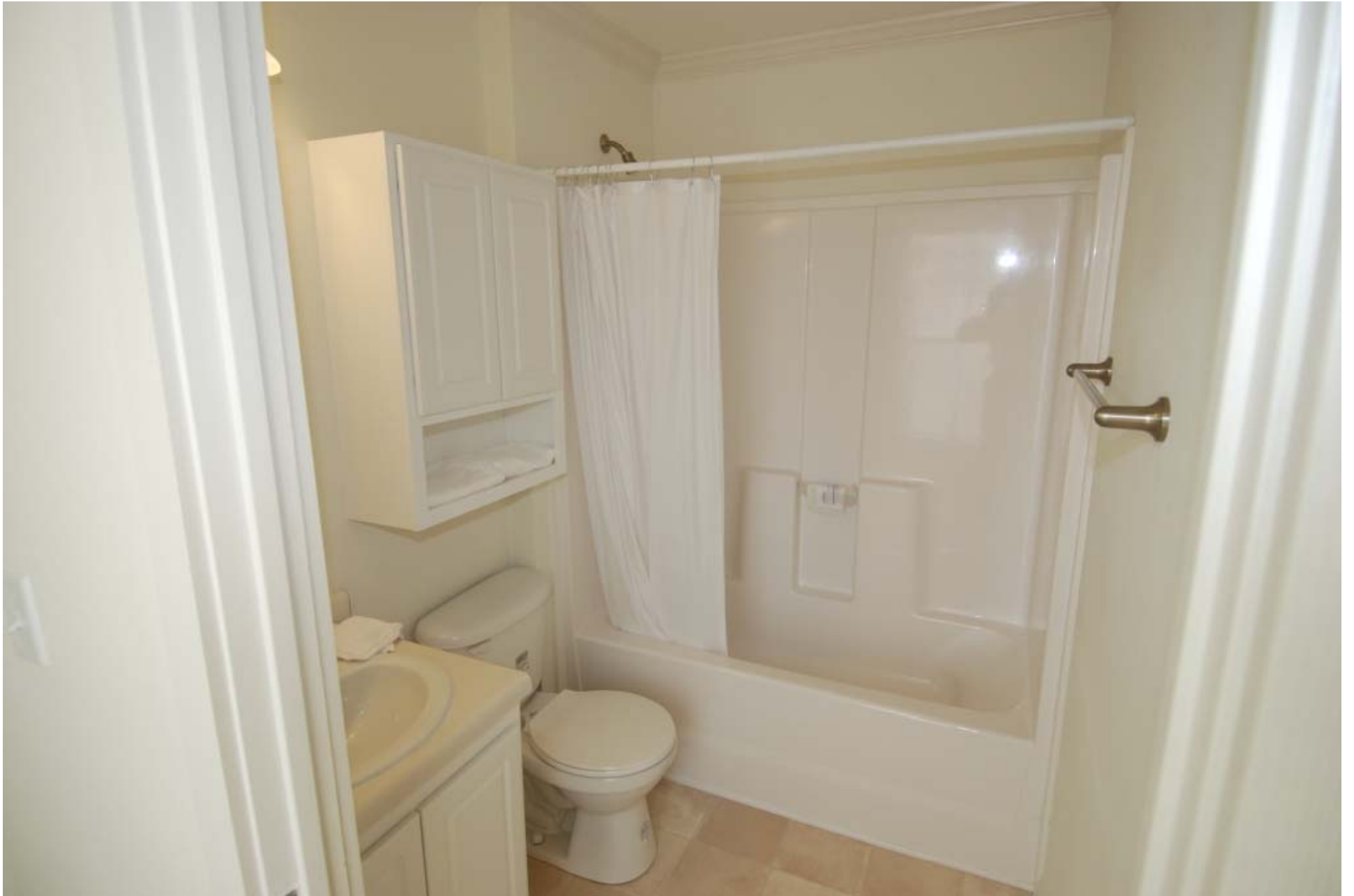
MS Park Model