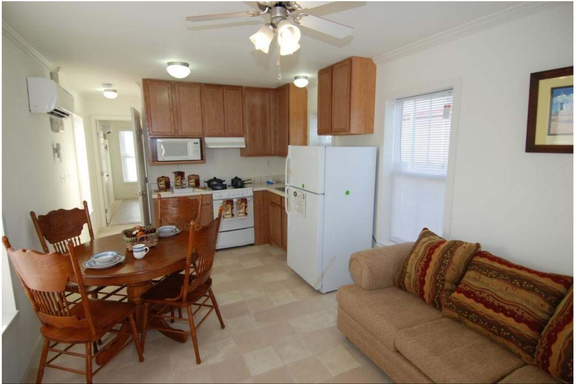
MS Park Model