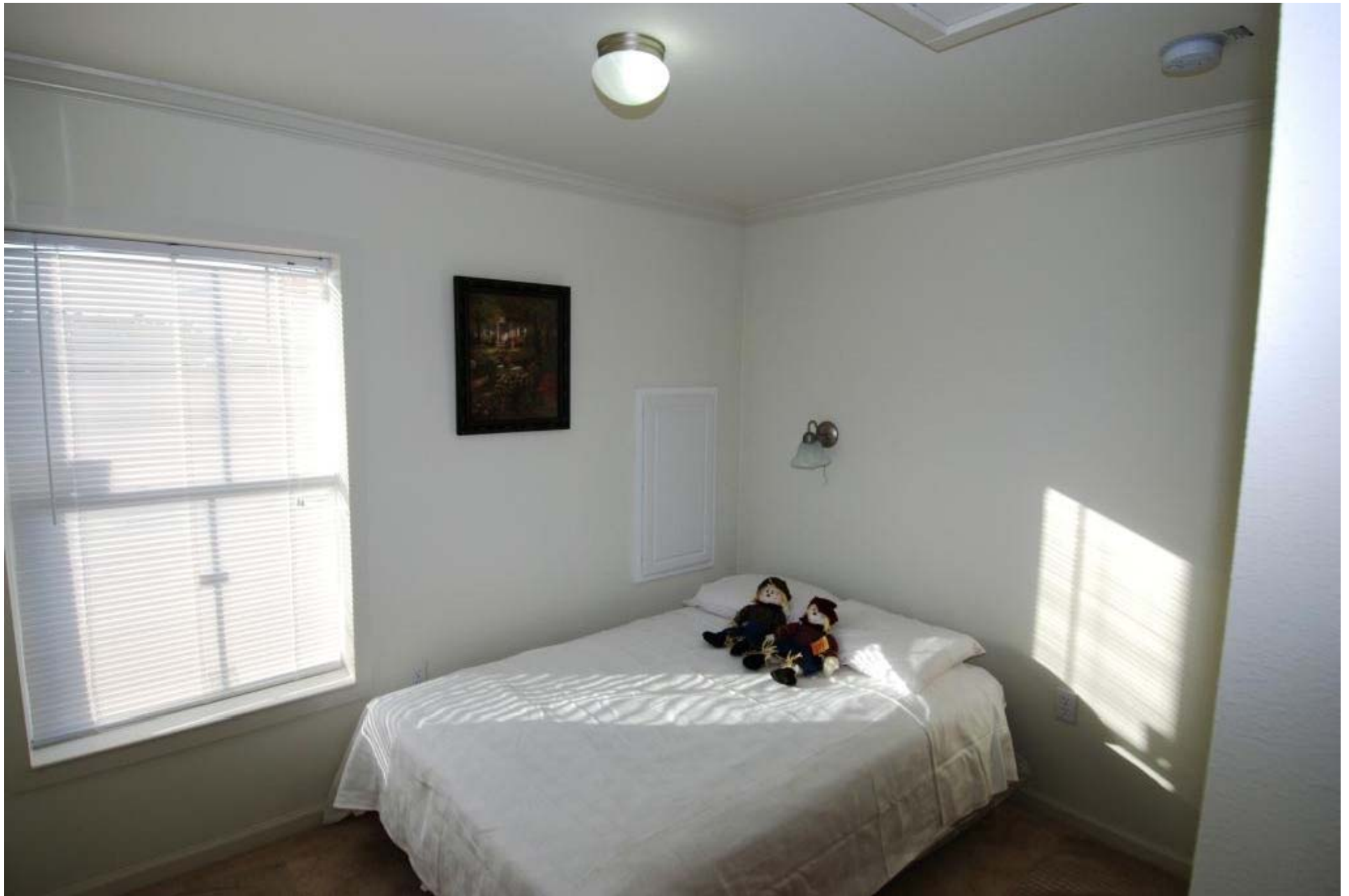
MS Park Model