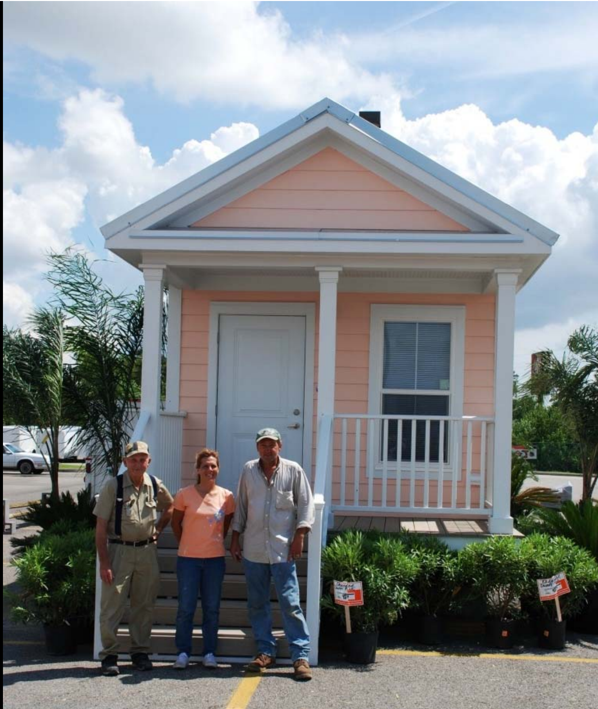
MS Park Model