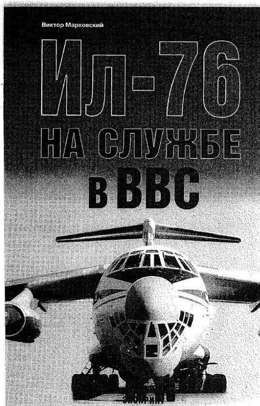
Pamphlet seized from Bout at the time of his arrest

Bout's alleged co-conspirator repeatedly identified Bulgaria as the source of at least some of the weapons that were to be delivered to the FARC. On 26 January 2008, Smulian "...informed CS [Confidential Source] -1, CS-2 and CS-3 that Bout had 100 Igla surface-to-air missiles available immediately..." and "advised that the weapons are in Bulgaria..." 12 Several days later, Smulian reportedly confirmed that "the weapons are ready in Bulgaria." 13 The documents do not indicate whether Bout's suppliers were private dealers or government officials, or whether they were based in Bulgaria or simply storing the weapons there temporarily. 14 Answers to these questions could reveal the existence of a major arms trafficking entity and shed light on its operations, including the countries in which it is active.