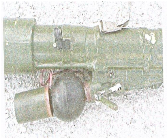
Close-up of the battery coolant unit on SA-18 MANPADS found in Somalia