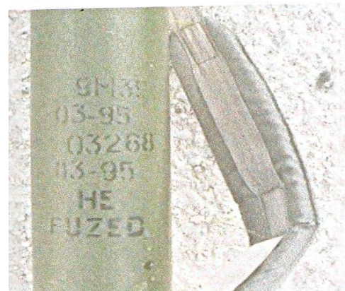
Markings on an SA-18 missile found in Somalia

Photos of a MANPADS found in Somalia appear to confirm some of the information on the missile provided by UN investigators, but many questions remain. The missile was one of two MANPADS found in Somalia that the Monitoring Group attempted to trace using serial numbers painted onto the weapon. A preliminary check of the serial numbers by the Russian government indicated that the missile depicted in the photo - an SA-18 Igla - was manufactured in 1995 and exported to Eritrea the same year.