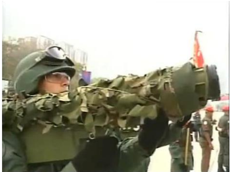
SA-24 MANPADS on display during military parade in Venezuela.

The transfer is the largest recorded in the UN Arms Register in recent years. Whether it is the largest MANPADS transfer is unclear since many countries either do not report to the Register or do not report on the quantities of systems transferred. Records of arms exports in other public data sources, including SIPRI’s expansive Arms Transfers Database, supports the assumption that the transfer to Venezuela is one of the largest in recent years.