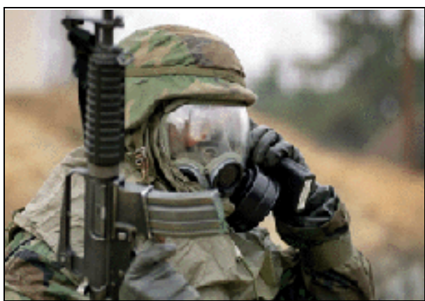
Military gear worn to protect against agents such as sarin

Sarin is a colorless, odorless, tasteless, human-made chemical warfare agent. It was originally developed in Germany in the 1930's as a pesticide. Sarin is a nerve agent—it disrupts the functioning of the nervous system. Nerve agents are the most toxic and rapidly acting of all known chemical warfare agents. Sarin is highly toxic in both its liquid and vapor states.