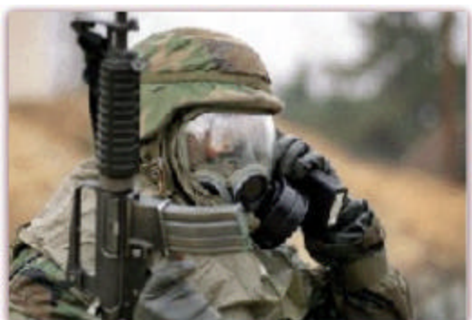
Military gear worn to protect against sarin

Sarin is a colorless, odorless, tasteless, human-made chemical warfare agent. It was originally developed in Germany in the 1930's as a pesticide. Sarin is a nerve agent—it disrupts the functioning of the nervous system. Nerve agents are the most toxic and rapidly acting of all known chemical warfare agents. Sarin is highly toxic in both its liquid and vapor states.