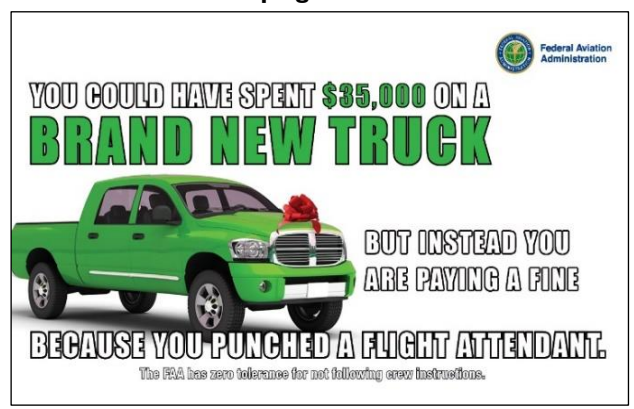
Figure 2. Digital Signage from FAA's 2021 Public Education Campaign