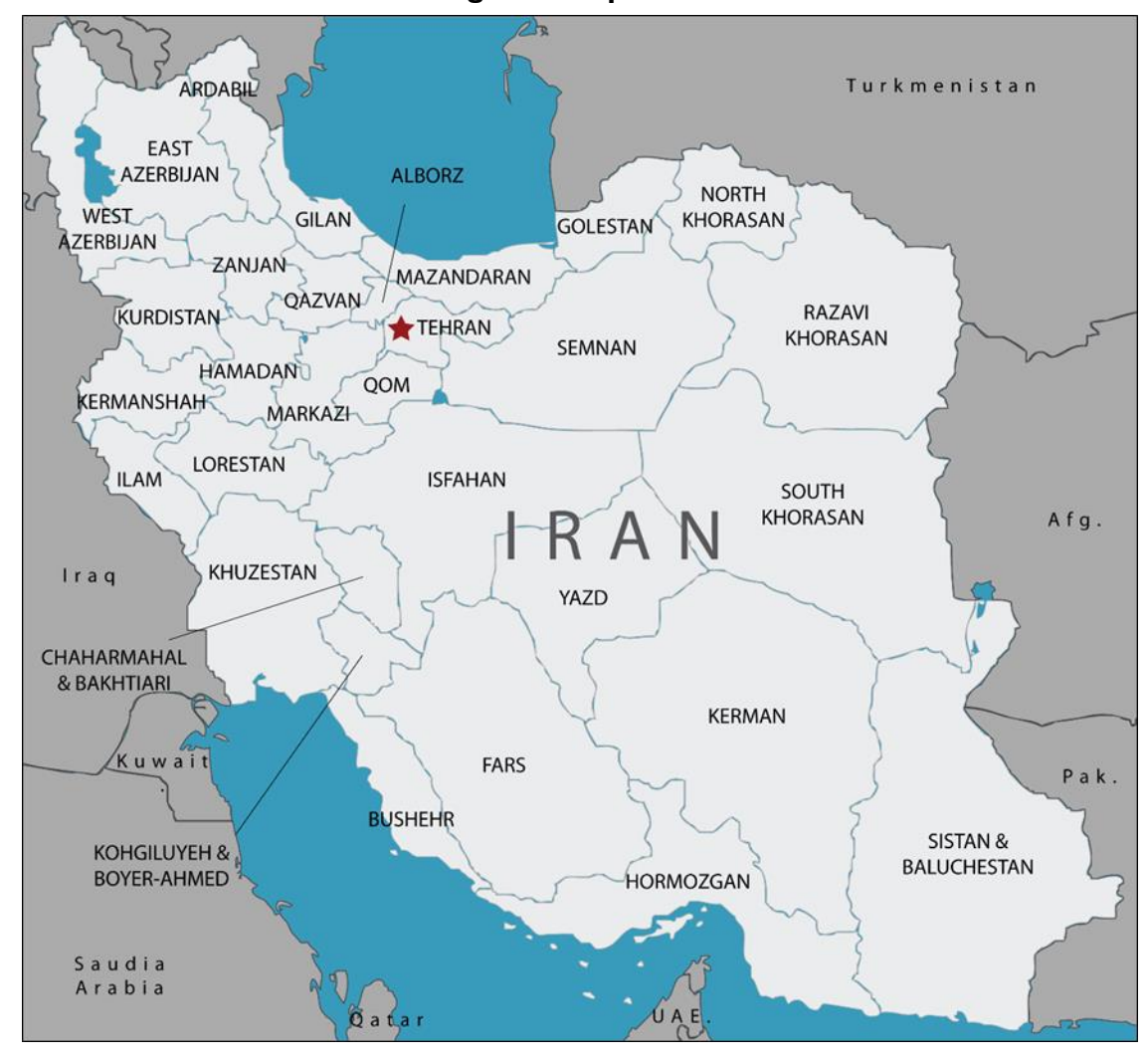
Figure 2. Map of Iran

Source: Map boundaries from Wikimedia Commons, 2007. Graphic: CRS.