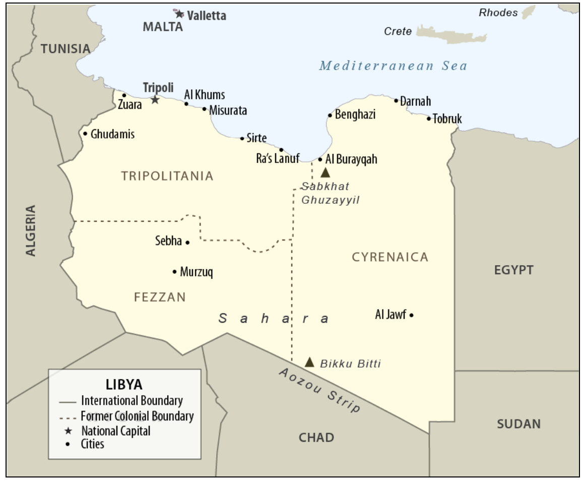
Figure 2. Political Map of Libya