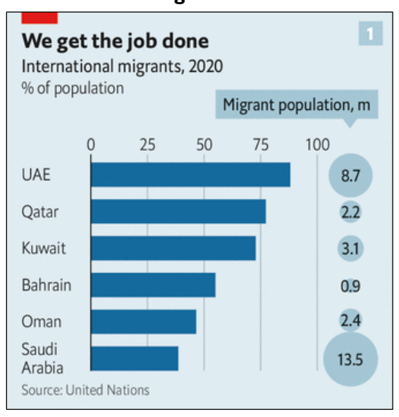
Figure 3. Migrant Population by Percentage in the GCC