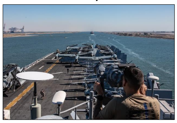
Figure 4.USS Bataan Transits the Suez Canal on its Way to the Gulf

In order to reassure Gulf partners that the United States remains committed to their defense and the free-flow of maritime commerce in the Strait of Hormuz, in summer 2023, the U.S. military deployed additional naval and air assets and manpower to the Gulf. In July and August 2023, the U.S. Navy deployed to the Gulf the amphibious assault ship USS Bataan (LHD 50) along with a dock landing ship (USS Carter Hall-LSD 50) and guided missile destroyer. Along with these naval assets, the U.S. military also deployed several teams of U.S. Marines to ride on commercial oil tankers transiting the Strait of Hormuz in order to deter Iranian interdiction.<sup>146</sup> Furthermore, the U.S. Air