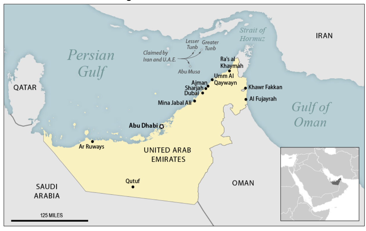
Figure 1. UAE at a Glance

The United Arab Emirates (UAE) is a federation of seven emirates (principalities): Abu Dhabi, the oil-rich federation capital; Dubai, a large commercial hub; and the five smaller and less wealthy emirates of Sharjah, Ajman, Fujayrah, Umm al Qaywayn, and Ra's al Khaymah. Since the late 1960s, the UAE's population has increased from 180,000 to over 9 million. Dubai, with a population of over 3 million, is the largest city and home to multiple expatriate communities from India, Pakistan, Bangladesh, the Philippines, Iran, Egypt, Nepal, Sri Lanka, China, and elsewhere (see Figure 1 ). Expatriates make up nearly 90% of the total UAE population.