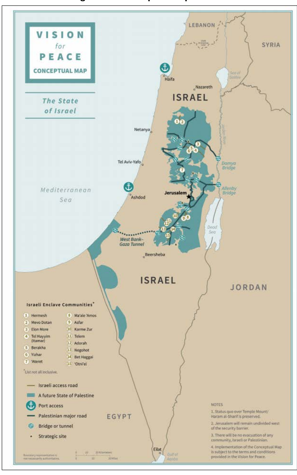
Figure B-1. Conceptual Map of Israel