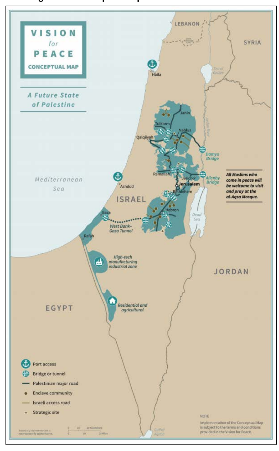
Figure B-2. Conceptual Map of Future Palestinian State

Source: White House, Peace to Prosperity: A Vision to Improve the Lives of the Palestinian and Israeli People, January 2020.