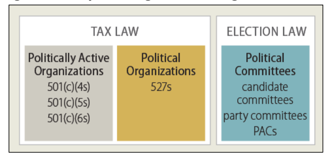
Figure 1. Policy Challenge: Intersecting Areas of Law

Understanding the roles that different groups play in elections depends on two questions. First, are the groups regulated primarily by federal election law or federal tax law, as shown in Figure 1 ?