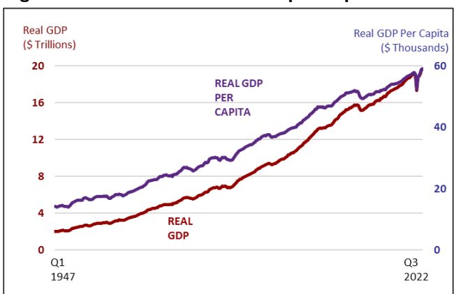
Figure 2. Real GDP and Real GDP per Capita