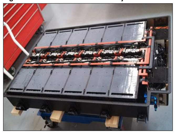
Figure 2. Inside an Electric Bus Battery Pack

In most cases, manufacturers import lithium ion cells to create batteries in the United States. The development of a domestic electric battery industry was a priority of a 2009 stimulus law grant program designed to increase U.S. capacity for producing electric batteries. The slow pace of electrification of the much larger U.S. passenger vehicle market, however, has not produced economies of scale that would allow U.S. cell producers—including those who could produce cells for electric buses—to be competitive with Asia-based manufacturers. A few cell manufacturers, including U.S.-based XALT Energy, have reportedly begun to make some cells for buses in the United States.