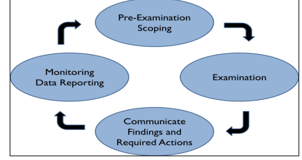
Figure I. The Bank Examination Cycle

Regulators have complementary tools to achieve their supervisory goals (see Figure 1 ). They continuously monitor banks, often using information banks are required to report or that was gathered during previous examinations. Supervision is an iterative process, and examiners can use information gathered through monitoring to determine the scope and areas of focus for upcoming exams.