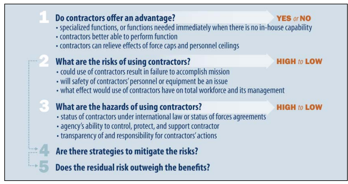
Figure 5.A Possible Framework for Addressing Questions of Contract Policy

Source: Congressional Research Service, based on Rand Research Brief, Civilian or Military? Assessing the Risk of Using Contractors on the Battlefield (2005), available at http://www.rand.org/pubs/research_briefs/RB9123/index1.html.