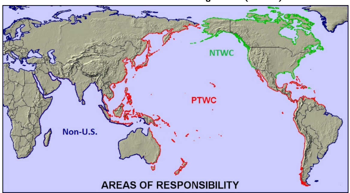
Figure 1. Areas of Responsibility for the Pacific Tsunami Warning Center (PTWC) and the National Tsunami Warning Center (NTWC)