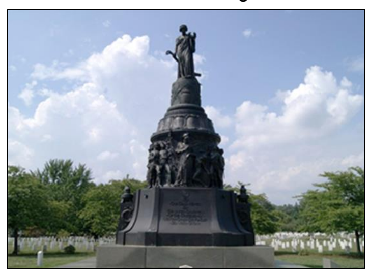
Figure 3. Confederate Memorial in Arlington National Cemetery