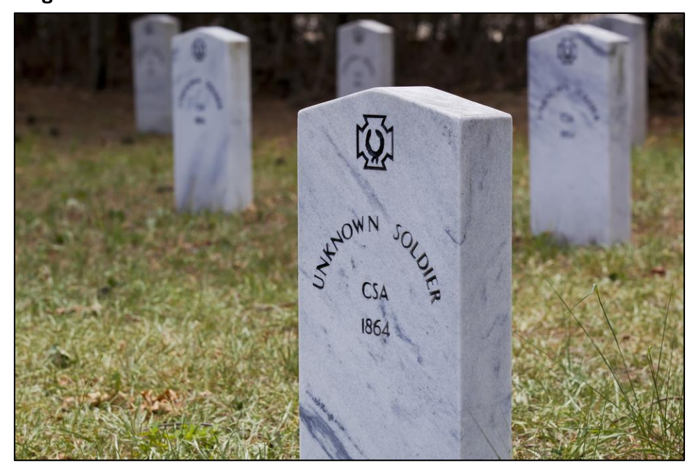
Figure 2. The Southern Cross of Honor on a Confederate Headstone

Veterans interred in national cemeteries, or in state or private cemeteries, generally are eligible for headstones or grave markers provided at no cost by VA. <sup>49</sup> For Confederate veterans, government headstones or grave markers may be provided only if the grave is currently unmarked. The person requesting a headstone for a Confederate veteran may select a standard VA headstone, which includes identifying information about the veteran and his or her service and an emblem of belief corresponding to the veteran's faith, or a special Confederate headstone that includes the Southern Cross of Honor as shown in Figure 2 . <sup>50</sup> The Southern Cross of Honor was created by the United Daughters of the Confederacy in 1898 and is the only Confederate emblem permissible on a government headstone or grave marker.