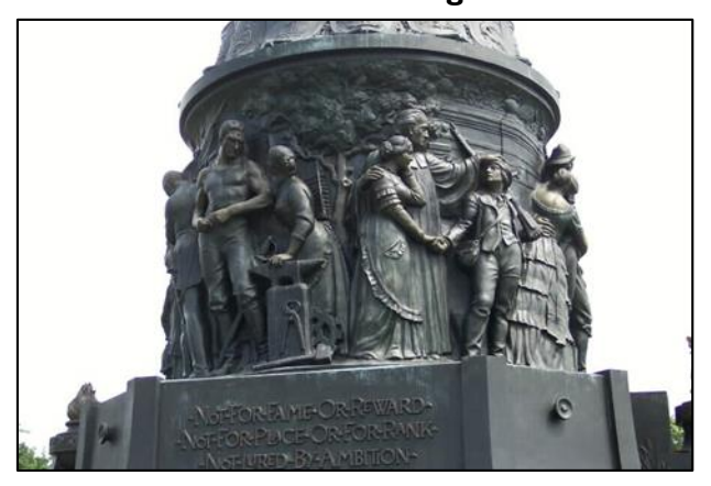
Figure 4. Details of the Base of the Arlington Confederate Memorial

Note: Moses Ezekiel was a well-known sculptor and Confederate veteran who was later buried at the base of the monument in 1921. The bronze monument stands 32 feet in height and is the South represented as a woman atop a base with a frieze composed of 14 inclined shields for each Confederate state and the border state Maryland. The memorial is surrounded by Confederate graves.