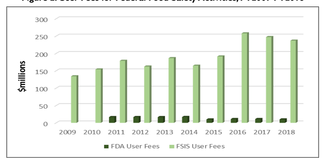
Figure 2. User Fees for Federal Food Safety Activities, FY2009-FY2018

Data are not adjusted for inflation.