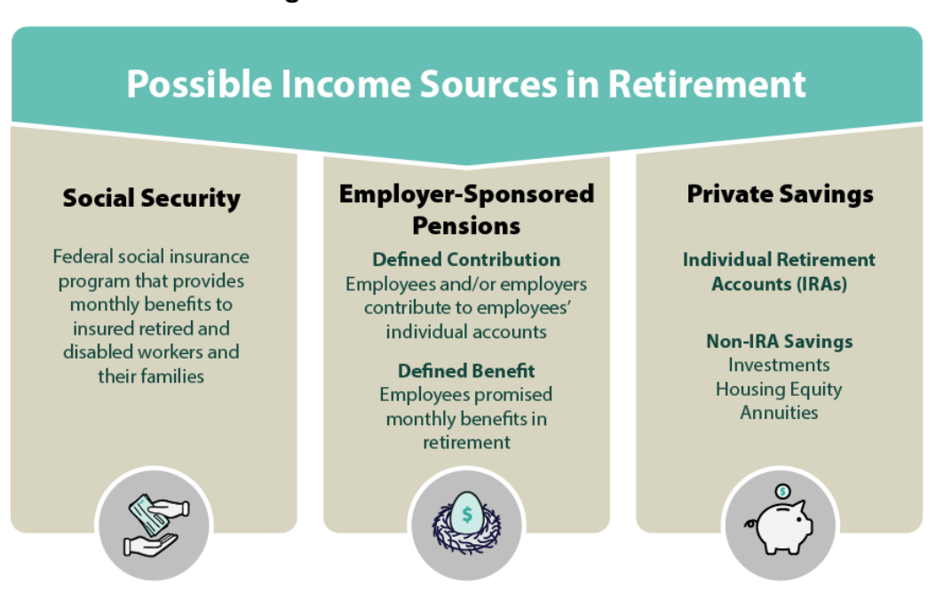
Figure I. U.S. Retirement Income

Retirement income in the United States can come from three main sources: Social Security, employer-sponsored pensions, and private savings ( Figure 1 ).<sup>4</sup> IRAs—a component of private savings—accounted for nearly one-third of total U.S. retirement assets at the end of 2019.<sup>5</sup> U.S. retirement assets included public and private defined benefit (DB) plans, defined contribution (DC) plans, annuities, and IRAs.<sup>6</sup> In 2019, about 25% of U.S. households owned IRAs.<sup>7</sup>