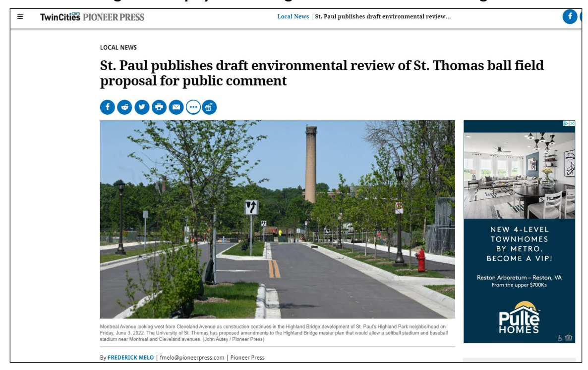
Figure 5. Display Advertising Sold via Indirect Advertising