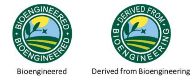
Figure 4. Disclosure Symbols of the Standard