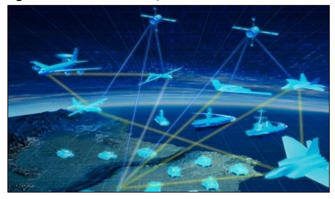
Figure 2. Visualization of JADC2 Vision