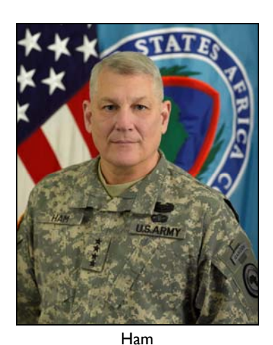
Figure 4. U.S. Commanders

Air Force Maj. Gen. Margaret Woodward, commander of 17<sup>th</sup> Air Force, was the initial Joint Force Air Component Commander for Operation Odyssey Dawn.