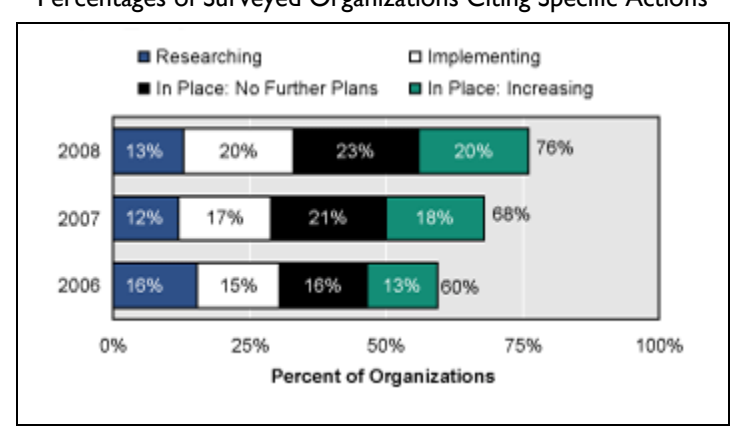
Figure 2. Data Center Consolidation Trends, 2006 to 2008 Percentages of Surveyed Organizations Citing Specific Actions