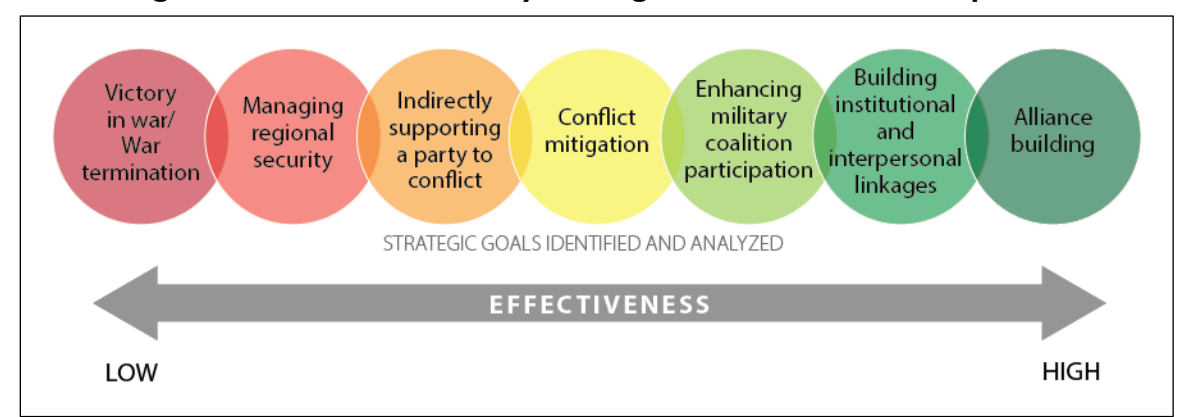
Figure 1. BPC Effectiveness by Strategic Rationale in Cases Explored

This report examines between two and four case studies for each strategic-level rationale, for a total of 20 cases.<sup>3</sup> The overall results are depicted in Figure 1 below: