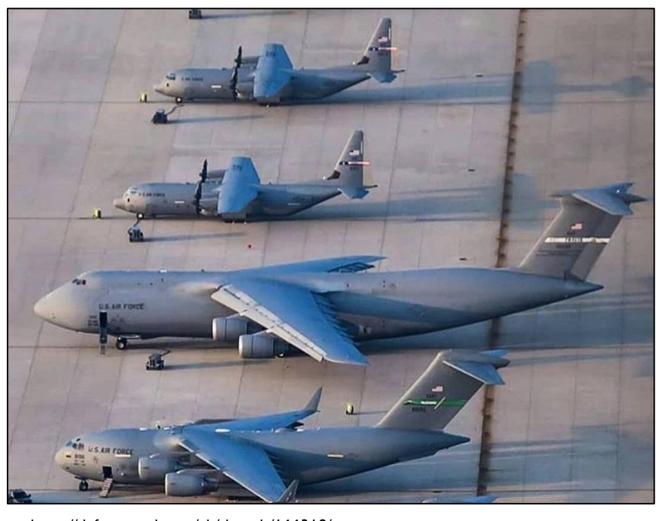
Figure 2. C-130, C-5 and C-17 Comparison

102 troops or 170,900 pounds of cargo. ^{432} One C-17 reportedly carried over 800 passengers to Al Udeid airbase in Qatar. ^{433}