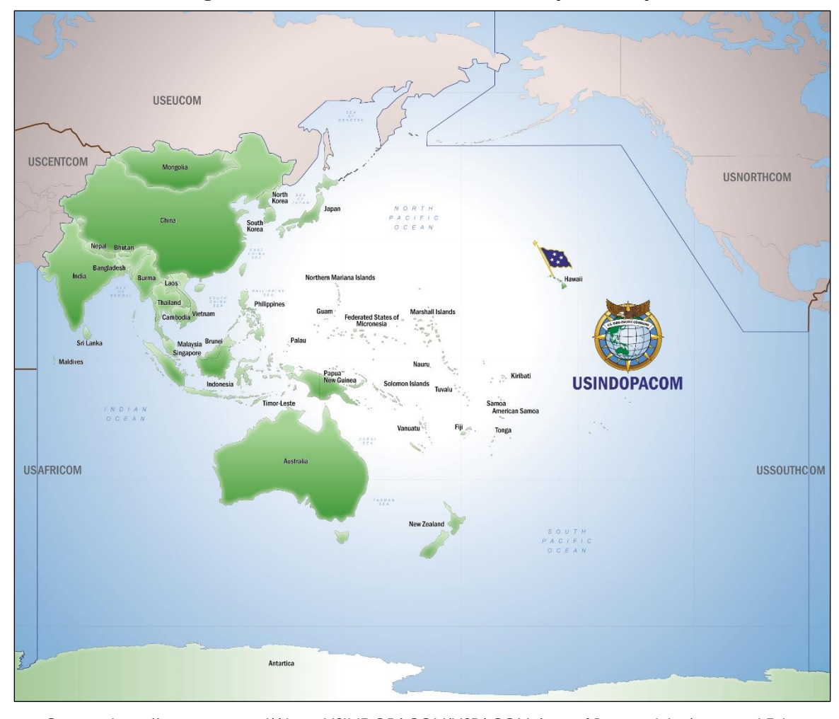
Figure 1. USINDOPACOM Area of Responsibility

Source: https://www.pacom.mil/About-USINDOPACOM/USPACOM-Area-of-Responsibility/, accessed February 7, 2022.