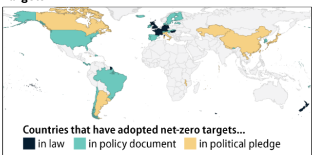
Figure 2. Countries That Have Adopted Net-Zero Targets