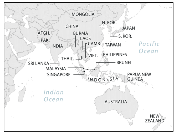
Figure 1. Map of the Indo-Pacific

Source: CRS. Boundaries from U.S. Department of State.