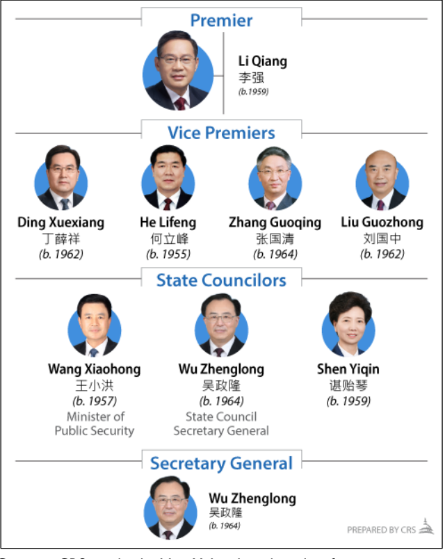
Current as of January 29, 2024.

The State Council (Figure 2) is the state's top institution, led by the Premier, who is also the Party's no. 2 official. Below him are four vice premiers, all members of the CPC Politburo. Below them are state councilors; they do not sit on the Politburo, but are members of other senior Party bodies and the State Council's own Party committee. In October 2023, Xi Jinping, in his capacity as state president, removed two state councilors from office: former Foreign Minister Qin Gang and former Defense Minister Li Shangfu. Both appear to have fallen afoul of investigations overseen by the Party's no. 7 official, Li Xi, who heads the Party's Central Commission for Discipline Inspection. Wang Yi now serves concurrently as the Party's top diplomat and as foreign minister, a less senior state position. Dong Jun is defense minister. Unusually, Dong, for now, is neither a state councilor nor a member of the Party or State Central Military Commission. The agencies that comprise the State Council are 21 government ministries, three ministerial-level commissions, the central bank, and the National Audit Office. Most of these agency leaders, but not all, are full members of the CPC Central Committee and head their own agencies' Party committees.