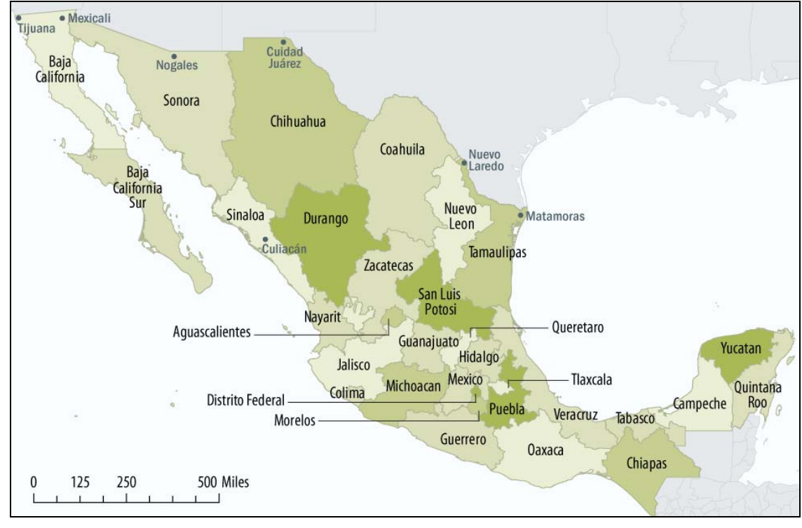
Figure 2. Map of Mexico