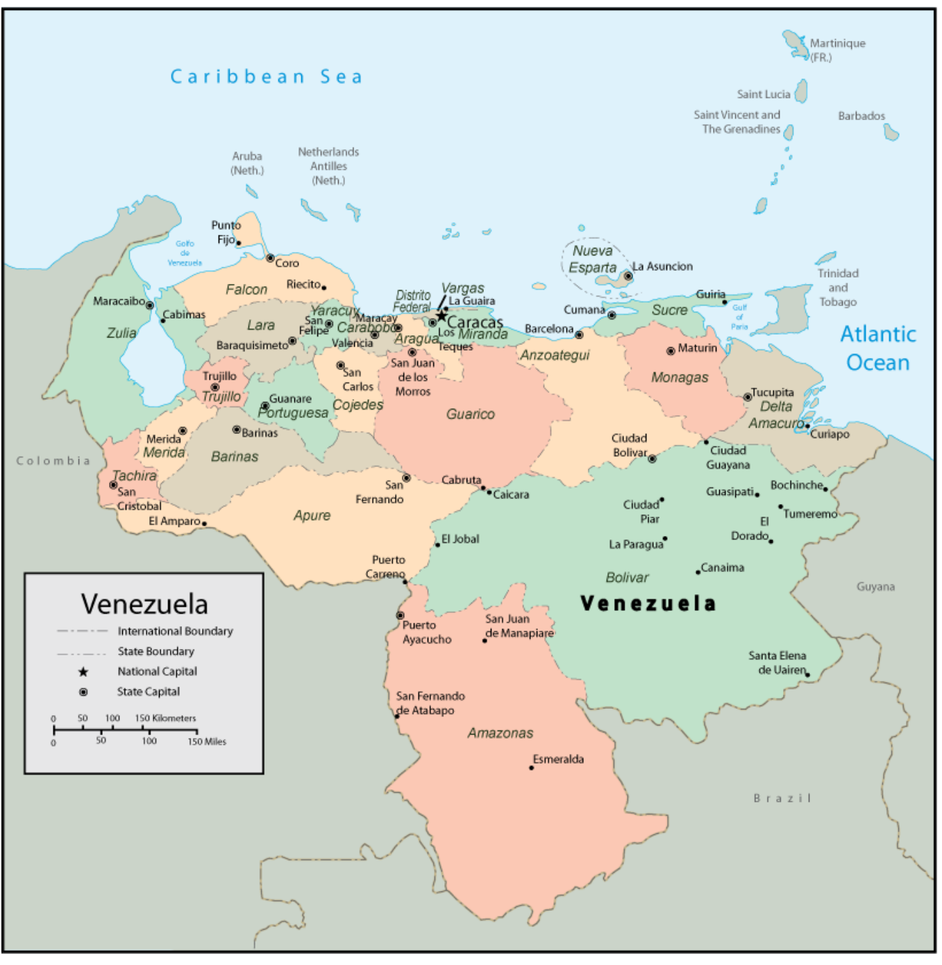
Figure 1. Map of Venezuela