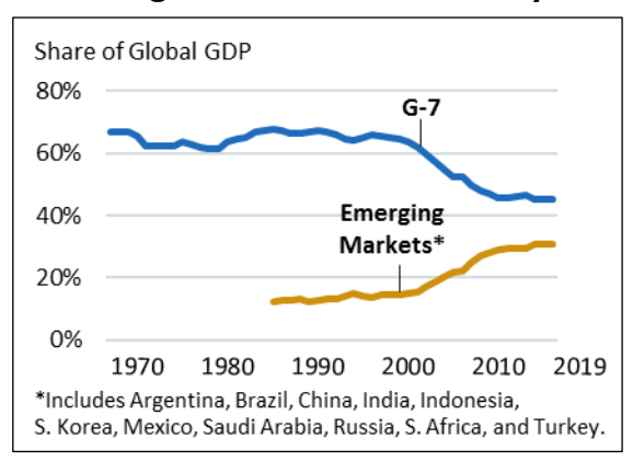
Figure 2. G-7 and Emerging-Markets: Weight in the Global Economy