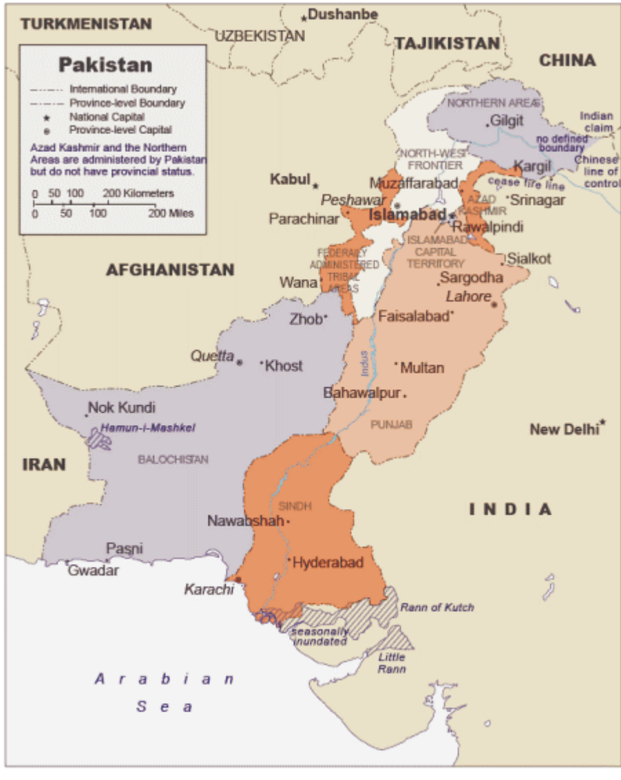
Figure 1. Map of Pakistan