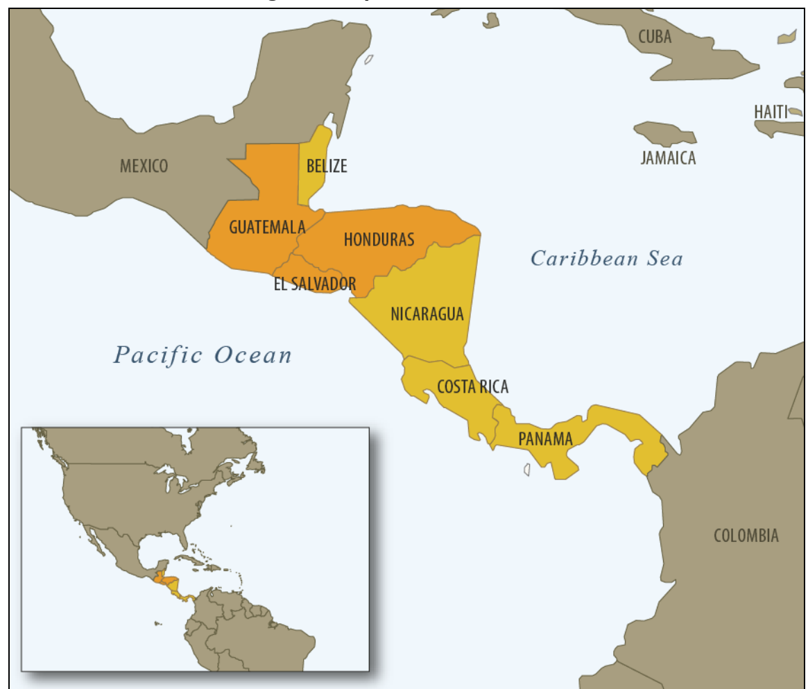
Figure 1. Map of Central America

Although more than seven years have passed since Congress first appropriated funding for the initiative, Central America continues to face significant security challenges. As Congress evaluates budget priorities and considers additional assistance for the region, it may examine the scope of the security challenges in Central America, the current efforts being undertaken by the governments of Central America to address those challenges, and how the United States has supported Central American efforts. This report provides background information about these topics and raises potential policy issues regarding U.S.-Central America security cooperation that Congress may opt to consider, such as the strategy and funding levels necessary to achieve U.S. objectives, how best to promote and protect human rights, and how U.S. domestic policies impact security conditions in the region.