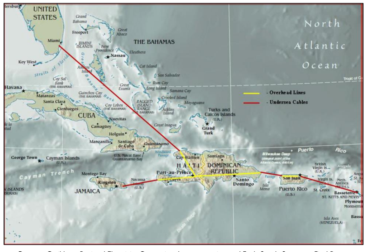
Figure 3. Potential Route for Interconnection from the United States

Source: Caribbean Regional Electricity Generation, Interconnection, and Fuels Supply Strategy—Final Report. See http://www.archive.caricom.org/jsp/community_organs/energy_programme/electricity_gifs_strategy_final_report_summary.pdf.