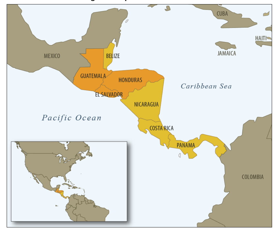
Figure 3. Map of Central America

Commission against Impunity in Guatemala (CICIG) and the Organization of American States-backed Mission to Support the Fight against Corruption and Impunity in Honduras (MACCIH)—have made significant progress in the investigation and prosecution of high-level corruption cases. Their efforts have generated fierce backlashes, however, and the Guatemalan and Honduran governments repeatedly have sought to undermine CICIG and MACCIH over the past year. (Also see section on "Corruption," above.)