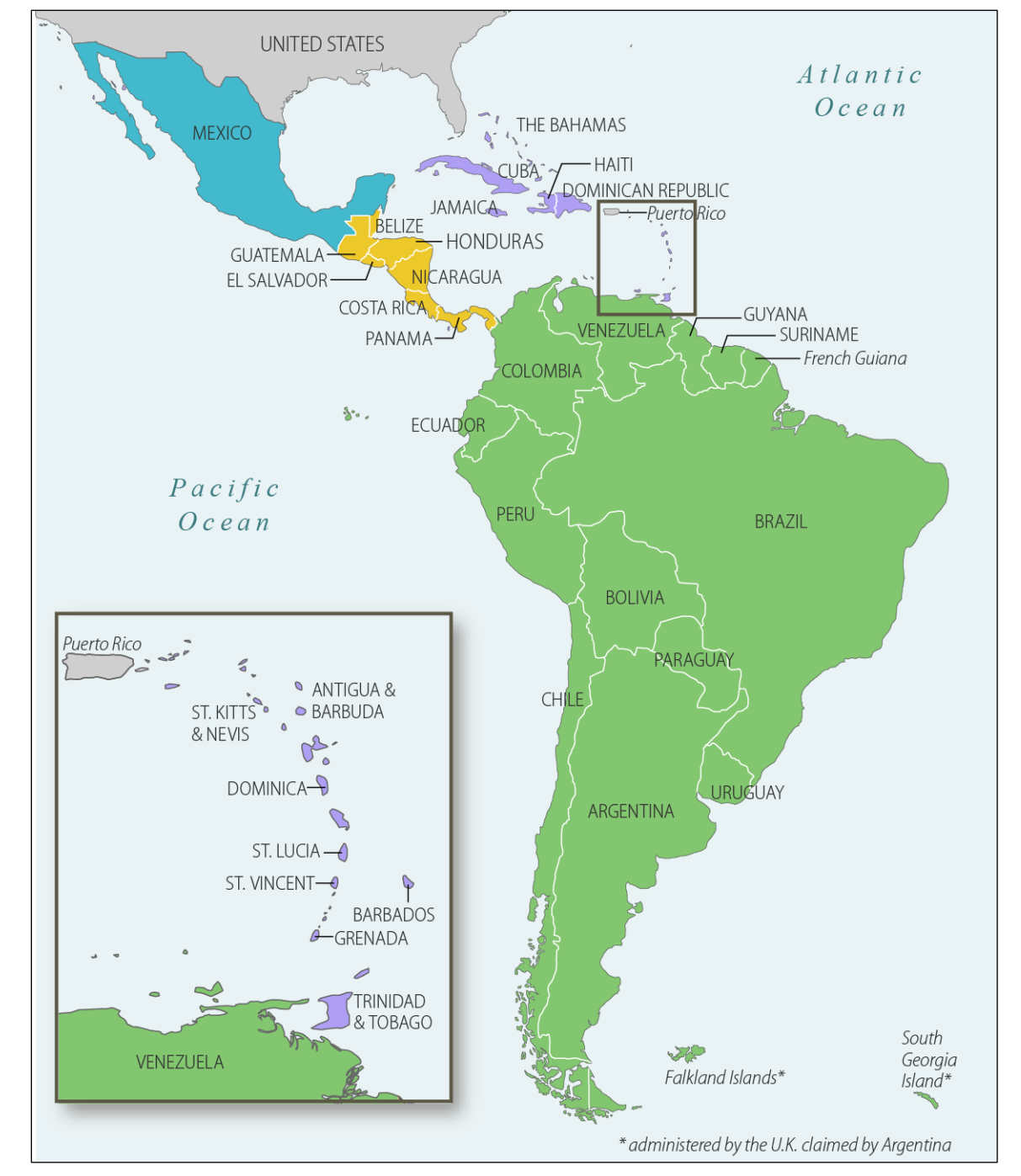
Figure I. Map of Latin America and the Caribbean