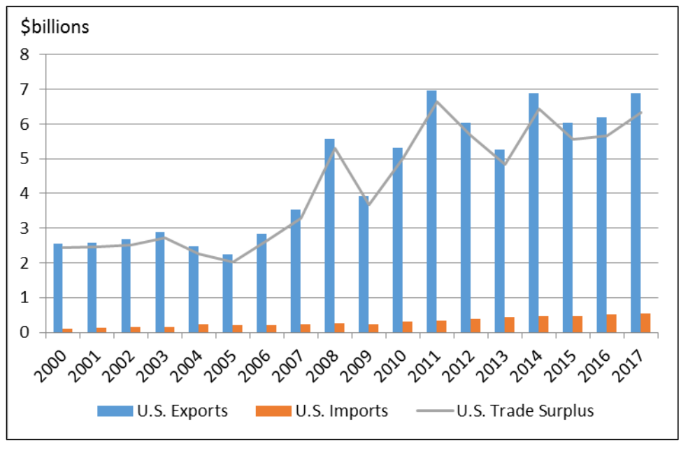
Figure 1. U.S.-South Korea Agricultural Trade

Data are in nominal dollars.