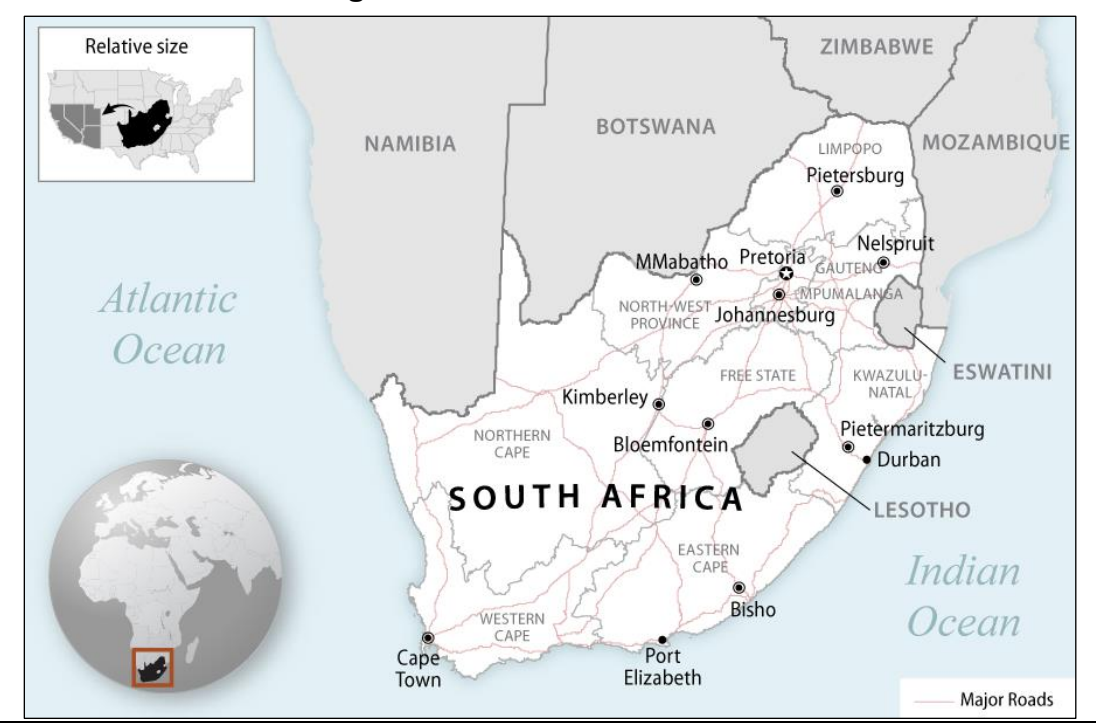
Figure 2. South Africa at a Glance

Population (Total/Growth): 59.6 million/1.4% (2020)Youth Population (ages 0-24): 45% (2020)Religions: Christian, 86%; traditional and related<br/>African religions, 5.4%; Muslim, 1.9%; other 1.5%,<br/>none/unspecified 5.2% (2015)Under-5 Mortality Rate: 34 per 1,000 live births<br/>(2018)Literacy Rate (% of adults): 95% (2017)Life Expectancy (years): 62.5 (male); 68.5 (female)<br/>(2020)Urban Population (% of total): 66% (2018)<br/>National Poverty Rate (population %): 55.5 (2014)HIV Prevalence (% of population): 13.01 (total<br/>population); 19.7 (adults aged 15-49 years) (2020)Median Age: 28 years