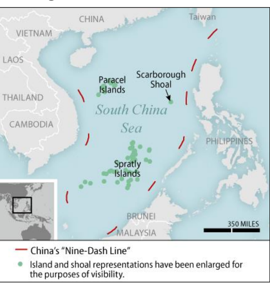
Figure 3. The South China Sea

To challenge what the United States considers excessive maritime claims and to assert the U.S. right to fly, sail, and operate wherever international law allows, the U.S. military undertakes both FONOPs and presence